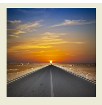
No investment strategy can guarantee success. All investing involves risk, including the possible loss of your contribution dollars.

There is no assurance that working with a financial professional will result in investment success.