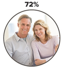
Were very or somewhat confident about being able to afford a comfortable retirement